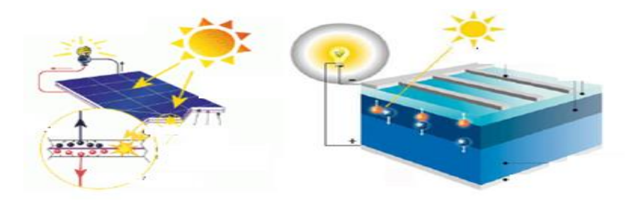
Figure 1. When calculating the use of solar energy, the amount of energy emitted by sunlight per 1 m 2 of area is taken into account.

Sunlight is the addition of four atoms of hydrogen and one atom of helium. As we know, the thermonuclear reaction begins when the temperature inside the sun reaches T=20 million °C. Therefore, thermonuclear energy is the primary source of all energy resources on Earth; coal, oil, gas; hydropower; wind and ocean energy. The sun is the source of all energy on earth. The sun emits an average of 88x10^{24} calories of heat or 368x10^{12} TVt of energy per second. However, only 2x10^{-6} % of this amount of energy, 180x10^{6} TVt, reaches the earth's surface. This is about 5,000 times the energy of all the world's permanent power plants.